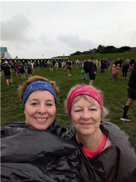
Great South Run-