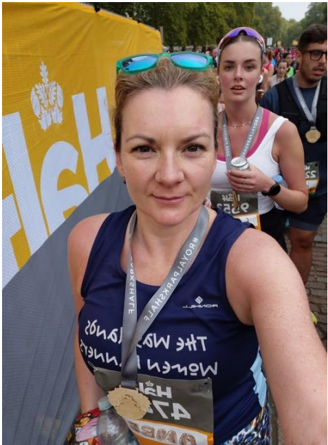
Royal Parks Half Marathon-